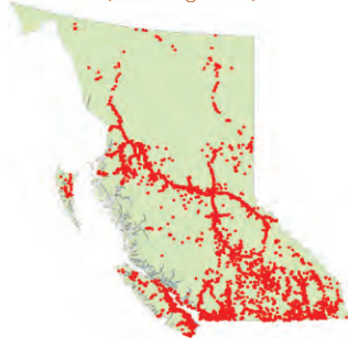
Distribution in BC (IAPP Aug. 2013)

Dispersal: Plants spread mainly through seed but also through roots. Seeds can be transported by birds, animals, and on vehicles that have been working in infested areas. Control of seed dispersal is more important than control of vegetative spread.